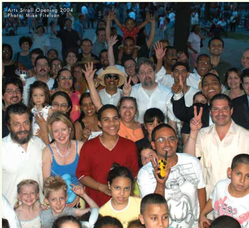
Arts Stroll Opening 2004