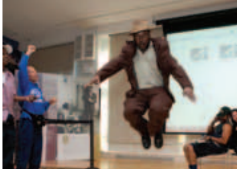
Uptown Arts Stroll Kick-Off Celebration

INFO: See Visual Arts Exhibitions Listing (p18)