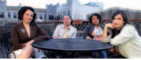
People's Theatre Project Resident Playwrights Unit