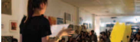
Word Up Community Bookshop

Este seminario se explorará la manera como se ha definido iniciativas de cambio social e invitar a los participantes a conocer los conceptos y las herramientas que se pueden aplicar a sus propios proyectos..