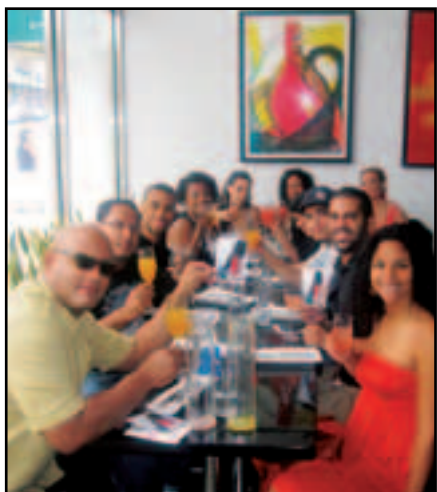
The Bago Bunch