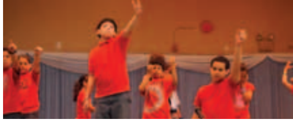
Shakespeare at the Palace